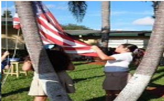
Students raising the flag at the remembering 9-11 event

The children and staff of VPS remembered 9/11. On Friday September 9th Village Pines dressed their red, white and blue and remembered the almost 3000 lives lost in the 9-11 tragedies.