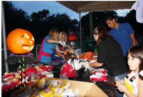
Trunk or Treat Pictures

October 28th we all had spooky fun at VPS' annual Trunk or Treat event! We dined, we danced, we trunk-or-treated! It was a beautiful rain free night!